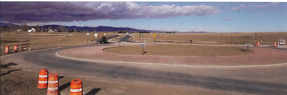
Top: New construction of Boyd Lake Ave Bridge over GLIC & new pedestrian box. Bottom: New alignment of Kendall Parkway.